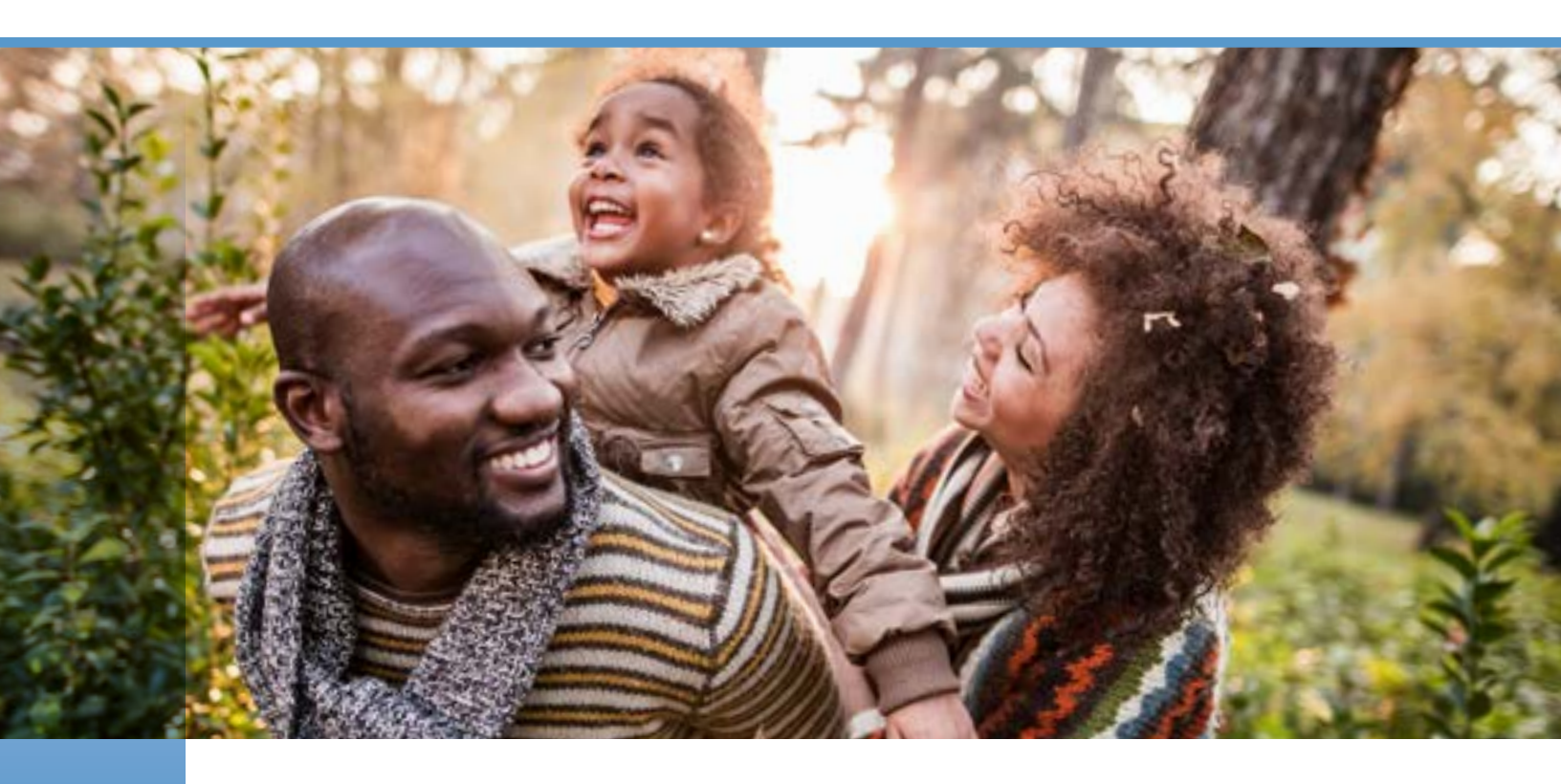
Child Health Plan Plus (CHP+)

Health Maintenance Organization (HMO) Plan